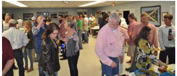
Coastal Area Oyster Roast James Island Yacht Club February 22, 2018