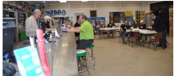
Pee Dee Area Meeting Longley Supply Company February 8, 2018