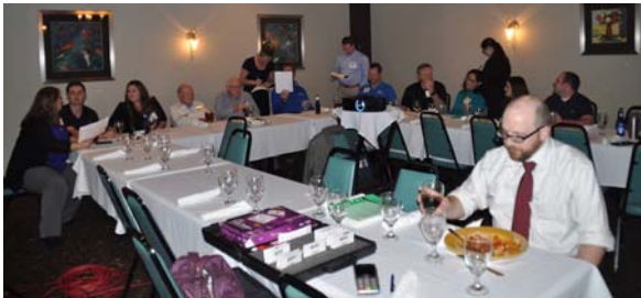
Piedmont Area Meeting Hahn-Mason Air Systems Inc. at Demetre's February 20, 2018