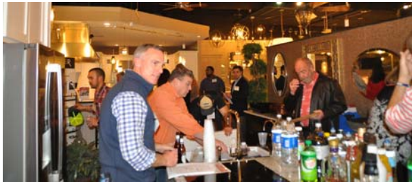
Midlands Area Meeting Ferguson Enterprises, Inc. February 2, 2018